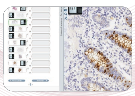
Slides are on the Aperio eSlide tray in <90 seconds