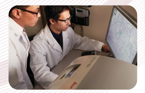
Review difficult cases with peers or collaborate globally