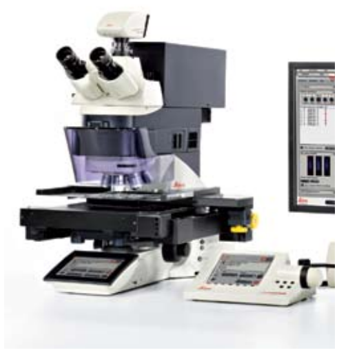
Laser microdissection technology allows pathologists to obtain selective, revelant results, quickly.